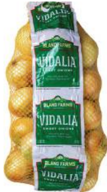
10 pound bag