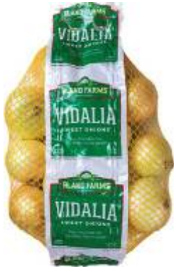
5 pound bag

More information will be put out as we get it. We will still have the same mix of products listed below.